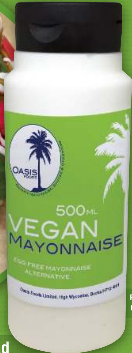
Pack size: 6 x 500ml